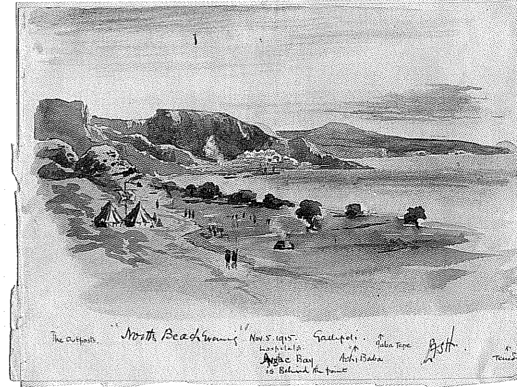
"North Beach Evening" by Major Leslie Fraser Standish Hore, 8 th Light Horse Regiment (Victoria) Mitchell Library, State Library of New South Wales

The Embassies are grateful for the generous support of the following sponsors: